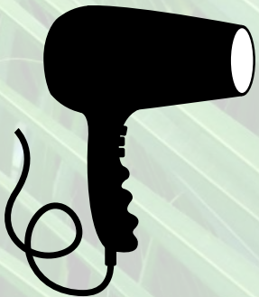
Beauty Salons /Spa Packages