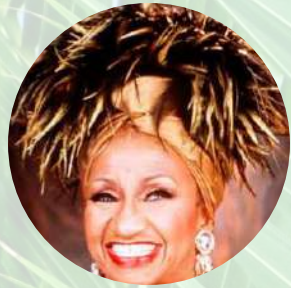
Table Sponsorship Opportunities