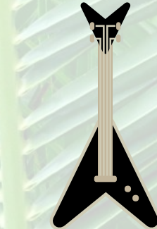
Concerts / Sporting Events