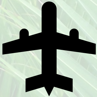
Travel and Leisure